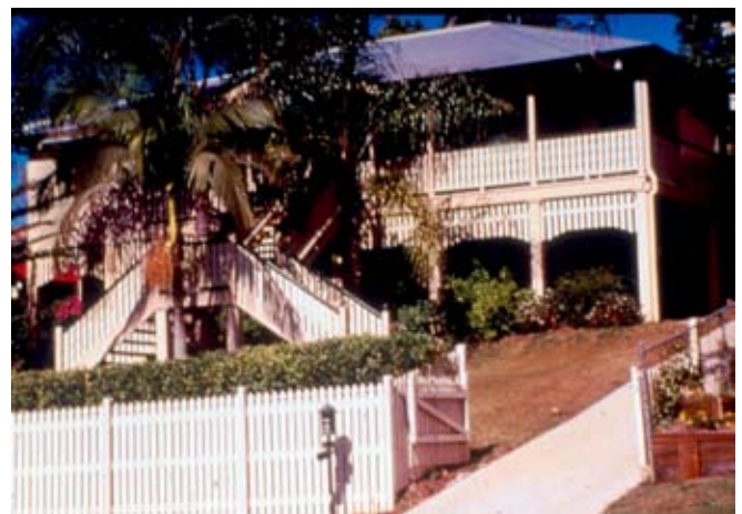
Figure 2. For suspended timber floors, termite shields and routine inspections provide adequate protection.