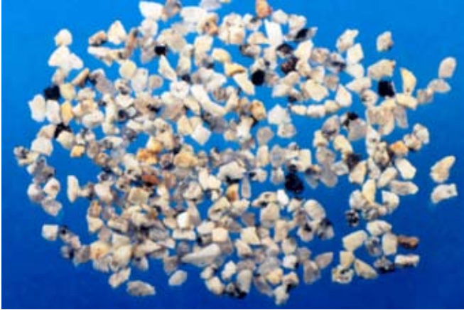
Figure 4. Graded stone barriers consist of compacted rock particles.