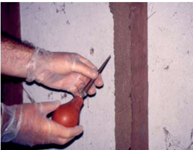
Figure 6. Toxic dust can be used to destroy the termite colony.

Toxic dust can be used to destroy a termite colony even when the nest has not been located (Figure 6). The treatment can be carried out only by an experienced operator licensed to obtain and use the dust.