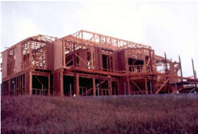
Figure 5. With slab-on-ground construction, many areas are inaccessible for inspection.

Modern building practices, such as those involving slab-on-ground construction (Figure 5), are not compatible with the incorporation of traditional physical barriers. The risk of termite entry into slab-on-ground constructions can be minimised by constructing slabs in accordance with Australian Standards AS 3600. The concrete should be placed, finished and cured using the procedures recommended by the Cement and Concrete Association of Australia to minimise cracks and voids. Control joints and slab penetrations can be protected by barriers such as stainless steel mesh or graded stone. These barriers can be also installed under the whole of the slab. Exposed slab edges provide ready detection of termite entry.